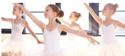
Prestige Dance Centre